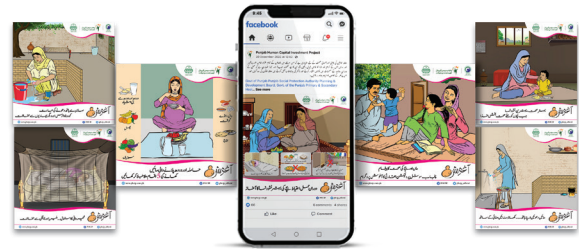
Image 6: PHCIP Social media post design on Health & Hygiene for the Aaghosh Program

To ensure consistency and continuity, these Facebook posts are being shared regularly throughout the month of December. With a frequency of two posts per week, the Project team is committed to maintaining a consistent online presence and fostering ongoing engagement with the target audience.