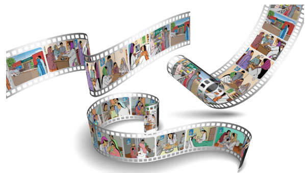
Image 1: Outline of Aaghosh Video Illustration and adaptation of illustration in reel - mockup