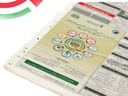
Image 4: 1221 Helpline logo, adaption of logo design in Print Ad and Flyer