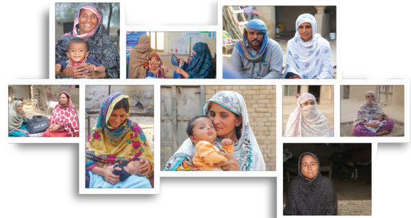
Image 2: Still Visuals from success stories of Aaghosh Program showing real-life beneficiaries.

In addition to video recordings, still photography was arranged during the visit. The Team captured in-depth and visually compelling images that will be used to develop print materials. These images will be incorporated into brochures, pamphlets, posters, Facebook posts and other promotional materials to complement the video content and provide a comprehensive visual representation of the Project's success stories and on-going impact.