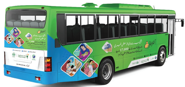
Image 5: PHCIP Bus Branding Proposal. For further branding suggestions, see Annexure 5 images – I, II, III, IV and V

By combining various communication channels and targeting specific locations, the Campaign aims to effectively raise awareness about the Project and its different components, ultimately reaching and benefiting the intended audience.