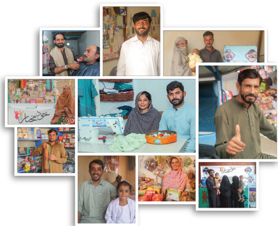
Image 3: Still Visuals from success stories of Khud Mukhtar Program showing real-life beneficiaries.