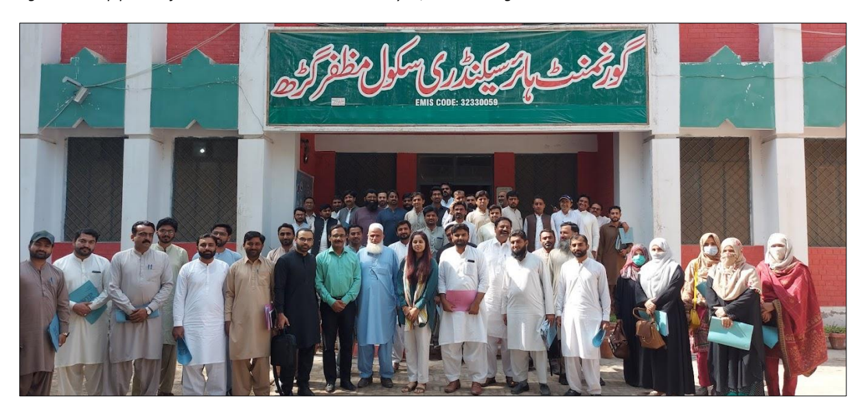
Figure 2 Group photo of PHCIP team with AEOs at Muzaffargarh