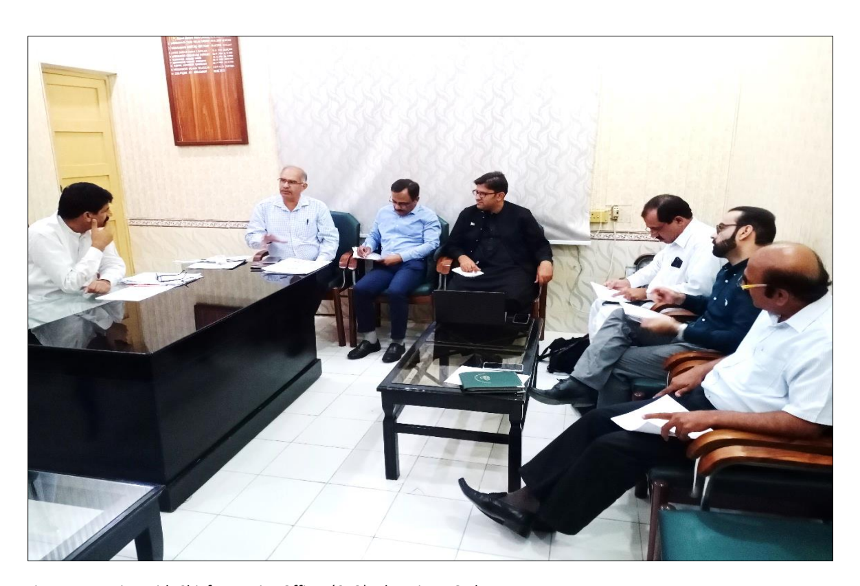
Figure 4 Meeting with Chief Executive Officer (CEO) Education DG Khan