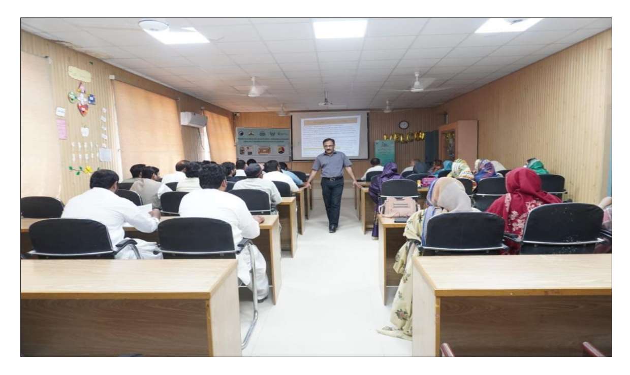
Figure 3 Training Class in Bahawalnagar