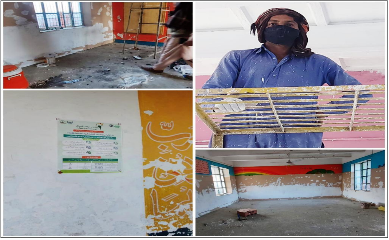
Renovated ECCE Classrooms