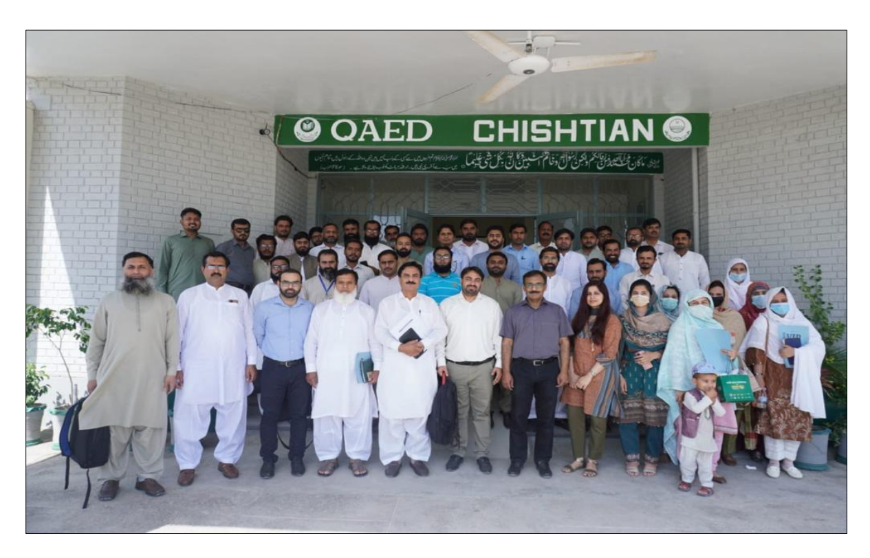
Figure 1 Group photo of PHCIP team with AEOs at Chishtiyan, Bahawalnagar

Selected Pictures of Trainings of AEOs on Due diligence, renovation of ECCE classrooms, Safeguards compliance and monitoring